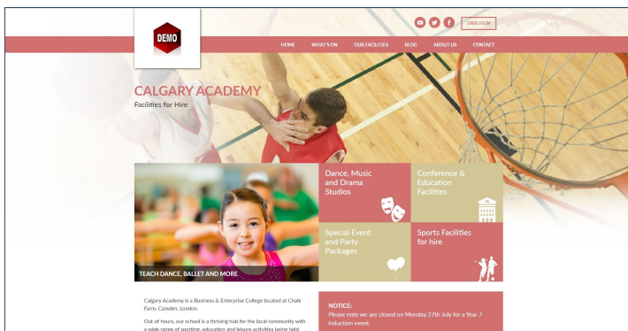
Calgary - http://calgary.schoolbookings.co.uk